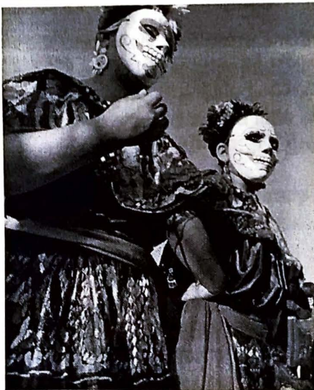
Above: Celebrants of Dia de Los Muertos in traditional clothing and masks.